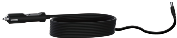
Cigarette lighter wire (Not configured, can be purchased separately)